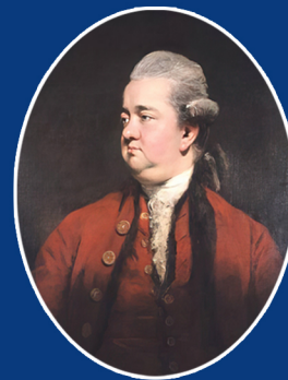
The History of the Decline and Fall of the Roman Empire (1776-1789) Edward Gibbon