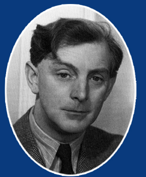
The Whig Interpretation of History (1931) Herbert Butterfield