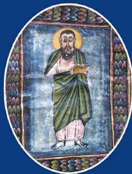
Ecclesiastical History (IV c.) Eusebius of Caesarea