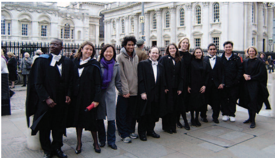
Clare Hall Graduates