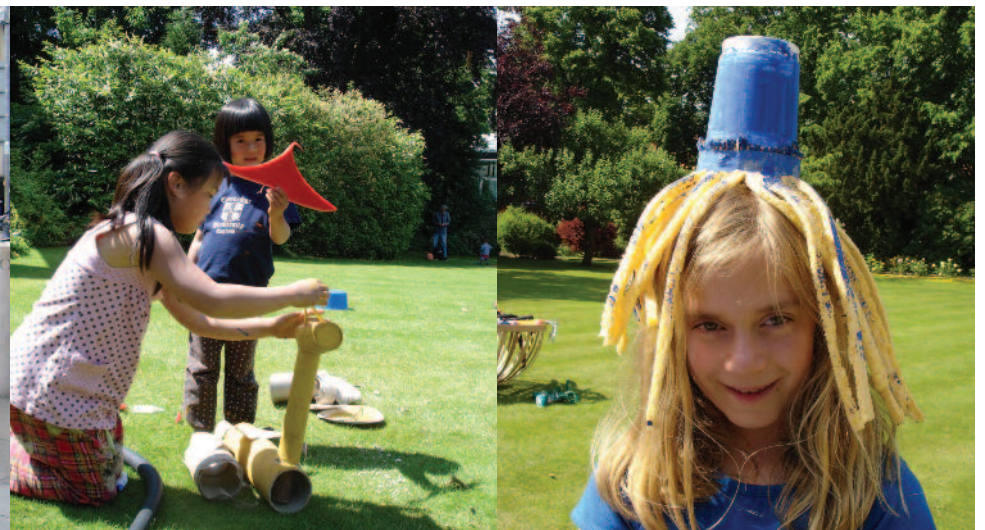
Children's Art Workshop