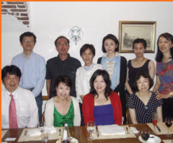
Japanese Alumni Group Meeting