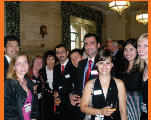
House of Commons Westminster Hall Reception