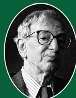
The Age of Revolution The Age of Capital The Age of Empire Eric Hobsbawm