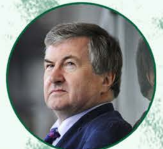
RICHARD J. EVANS

2pm Seminar “ The Age of Revolution ”, “ The Age of Capital ” and “ The Age of Empire ” by Eric Hobsbawm