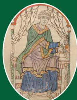
Historia novorum in Anglia Eadmer