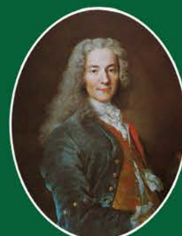
Le Siècle de Louis XIV Voltaire