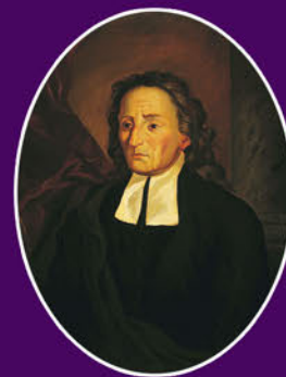
The New Science Giambattista Vico