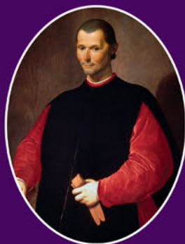
Florentine Histories Niccolò Machiavelli