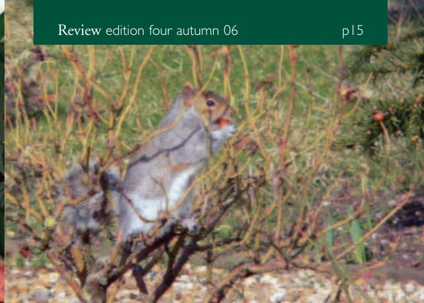
Elmside wildlife