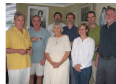
Former Clare Hall Visiting Fellows discover each other at lunch in Brisbane March 5, 2006